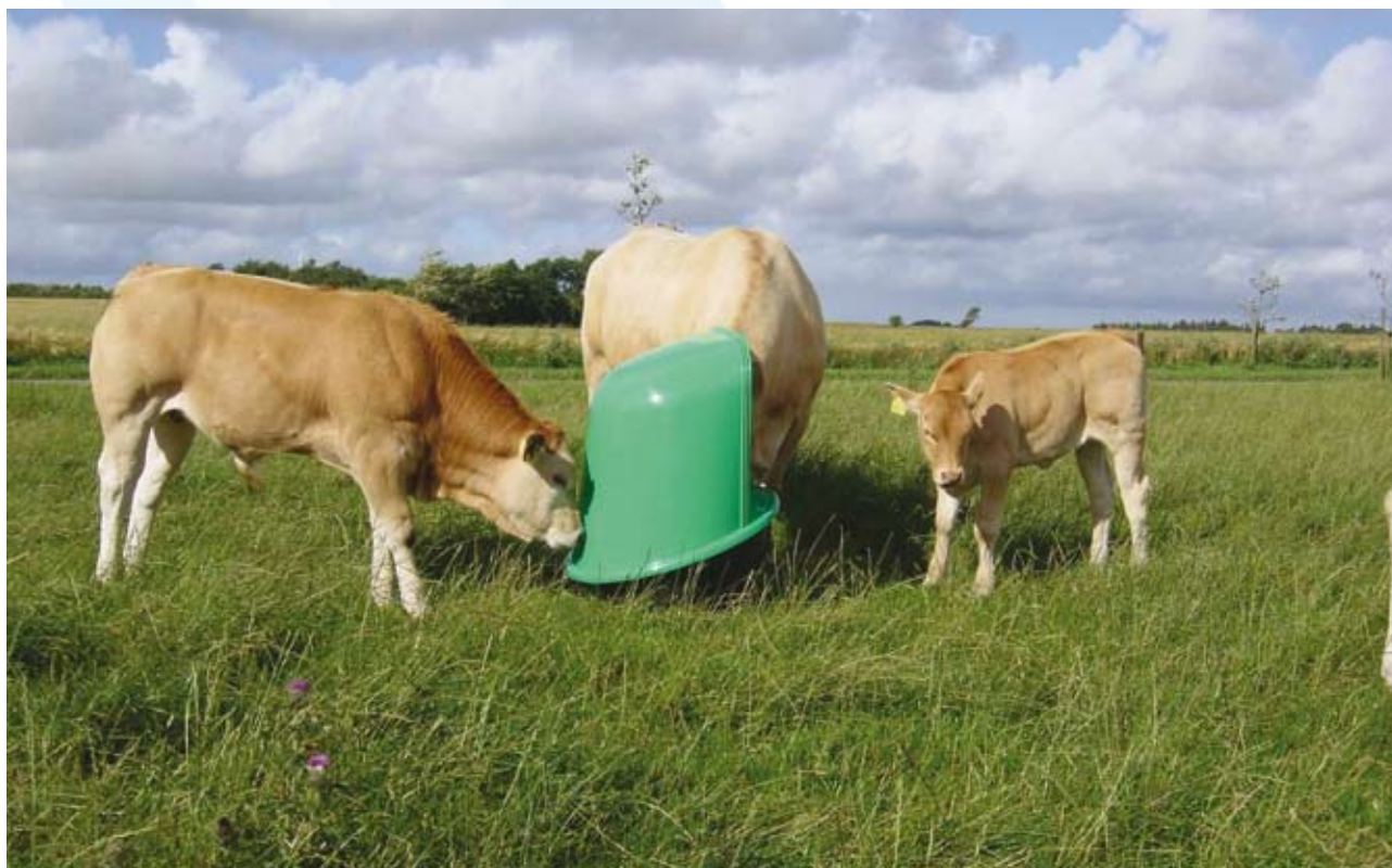
Picture 2: The feeder is easy to fill and to move from field to field.