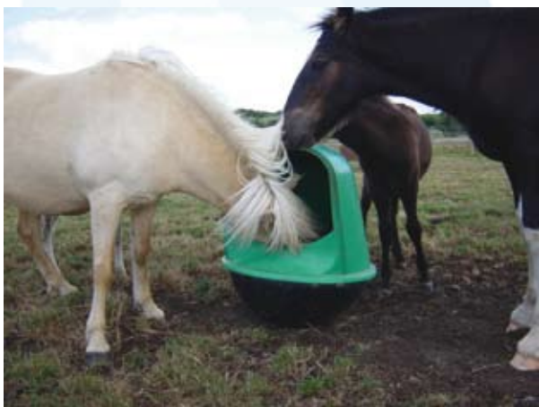
Picture 4: Horses (here Icelandic and Shire horses) eats minerals from the feeder.