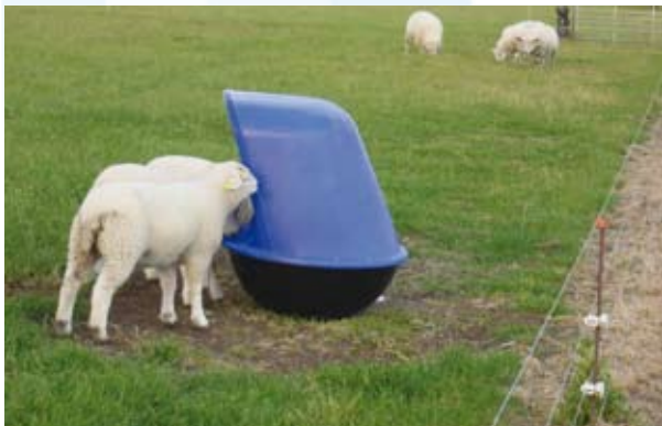
Picture 3: Lambs eat more grass and less milk around 25 kgs weight and gets thereby a need for mineral supplementation. The MicroFeeder model for sheep has a special design, with a lower and narrower eating opening, and inside there is a feeding tray so that they easily can reach the minerals from 25 kgs age.

From an immediate point of view the farmer can save € 900 - 467 = € 433 by choosing the MicroFeeder concept. In practice, though, the difference is much larger, because it is very seldom farmers buys enough buckets, and in the example above, the farmers would typically only buy 20-25 buckets for the flock, and not 60 as he should.