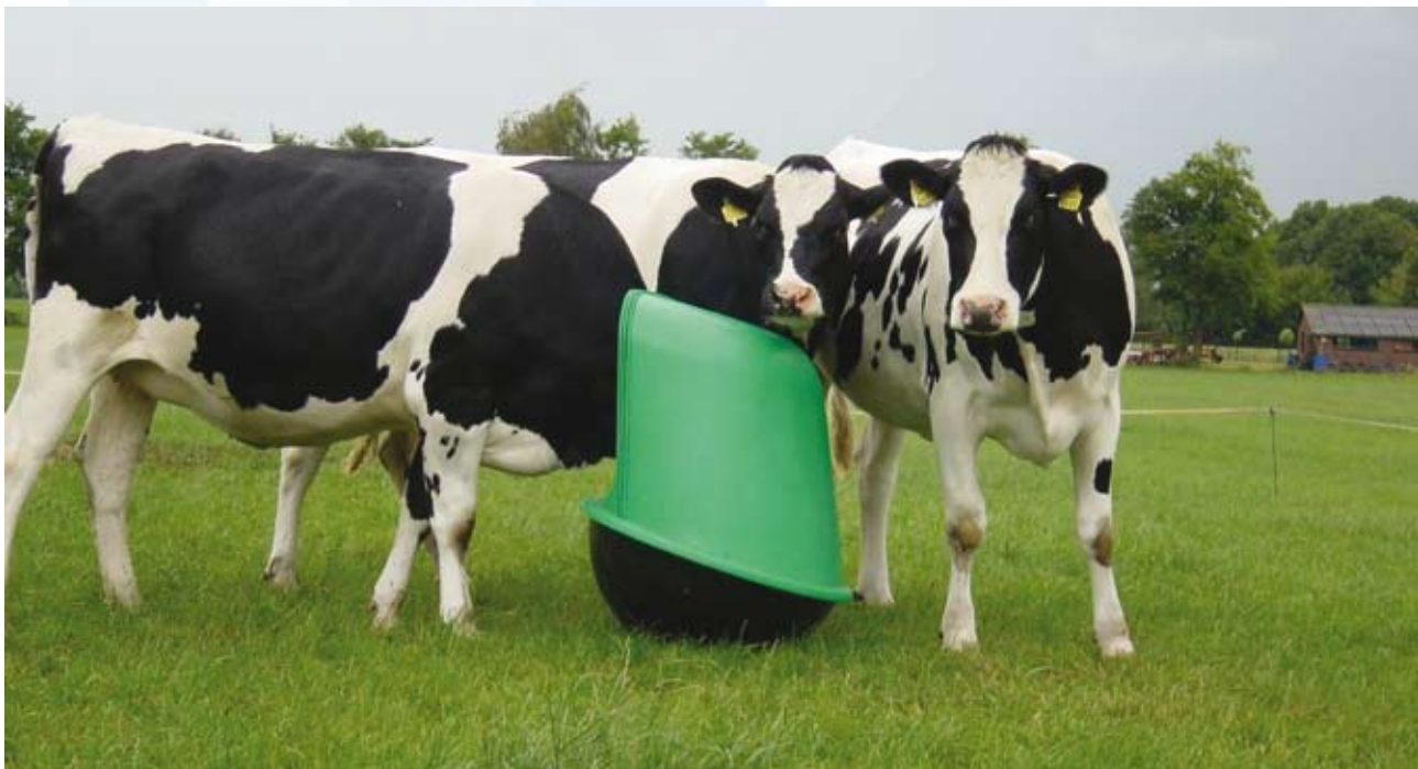
Picture 1: The Mineral Rocker is 88 cm high and 78 cm in diameter and it has a weight of app. 39 kilo. The weighted bottom ensures a self raising effect.

The feeder allow use of granulated minerals, which typically costs only half the price per kg compared to molassed minerals, and the minerals do not have to be of the expensive "watertight" version, which, apart from the price, have the disadvantage that the animals cannot taste the minerals through the coating layer, and therefore that they also cannot regulate the intake of the minerals themselves.